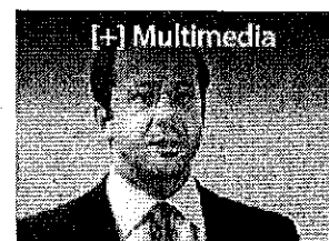
What is the CSCI?